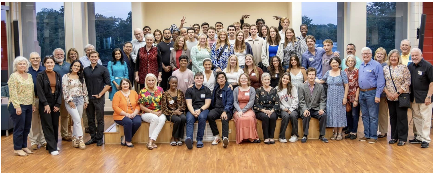
Posted by Katheryne Fields October 2, 2023