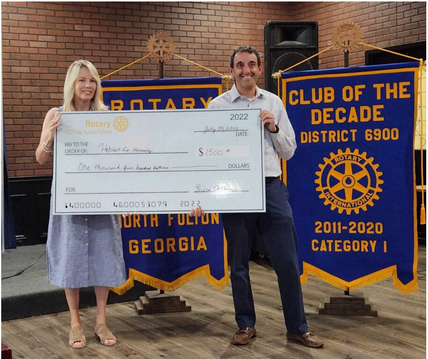
Posted by Lisa Gelber October 1, 2023