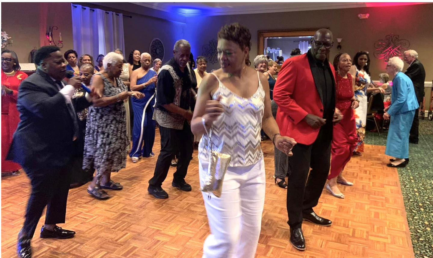
Posted by Vickie Butler October 2, 2023