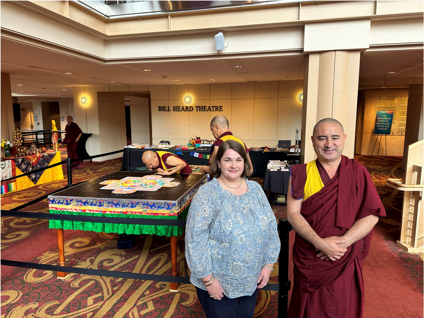
Posted by LeighAnn Dicesaris October 2, 2024