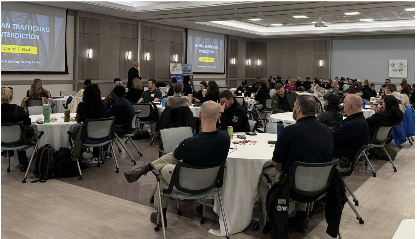
Posted by Mandy Timmons March 2, 2025