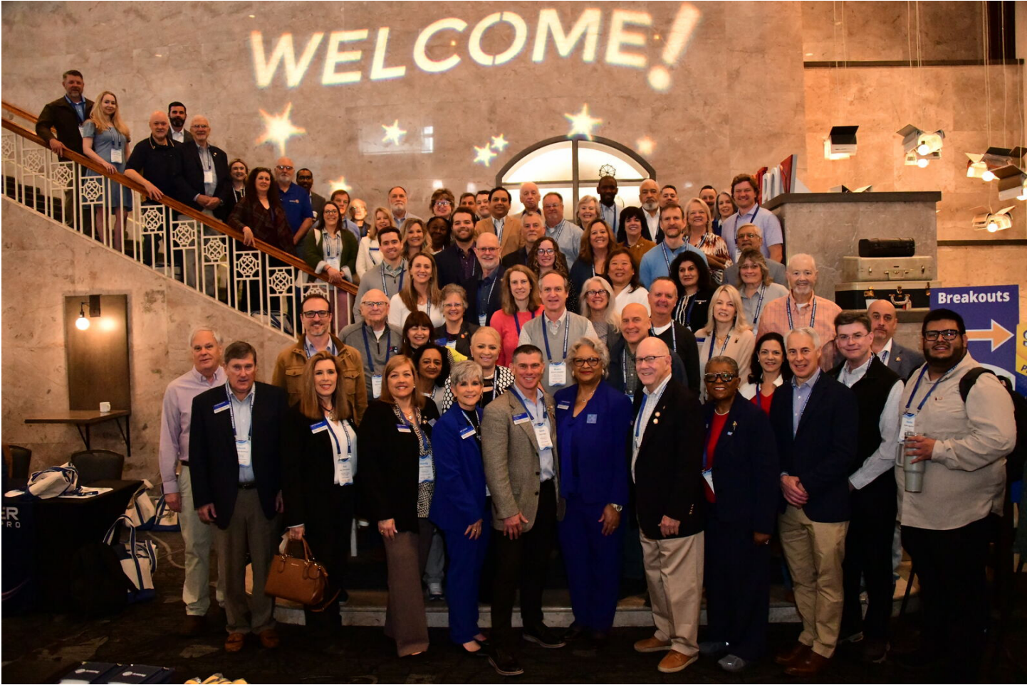
Peach State PELS - training our leaders for the 2026-27 Rotary Year