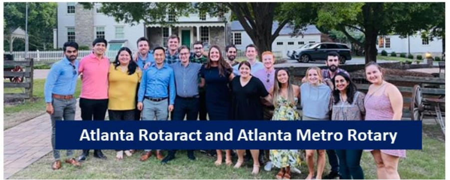
Atlanta Rotaract and Atlanta Metro Rotary