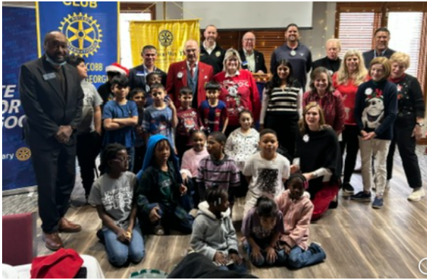
South Cobb Rotary Christmas