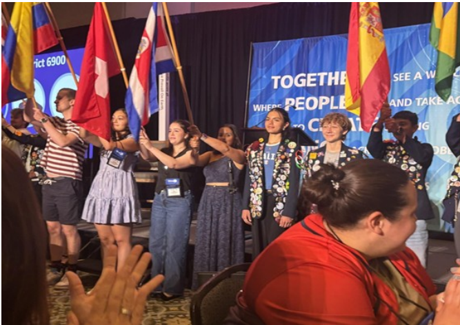
GRSP carries on tradition of presenting their flags