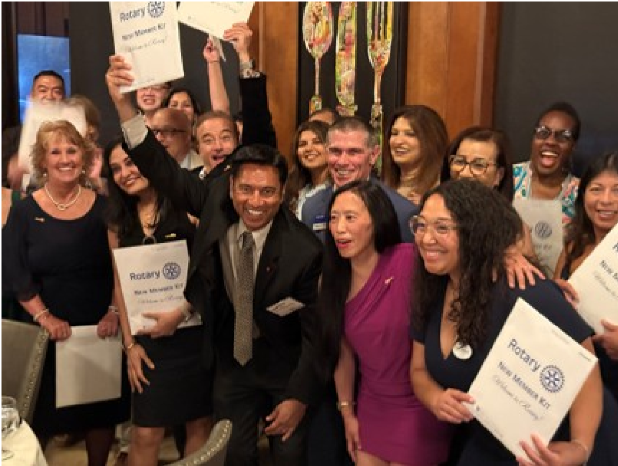
North Atlanta Professional Alliance