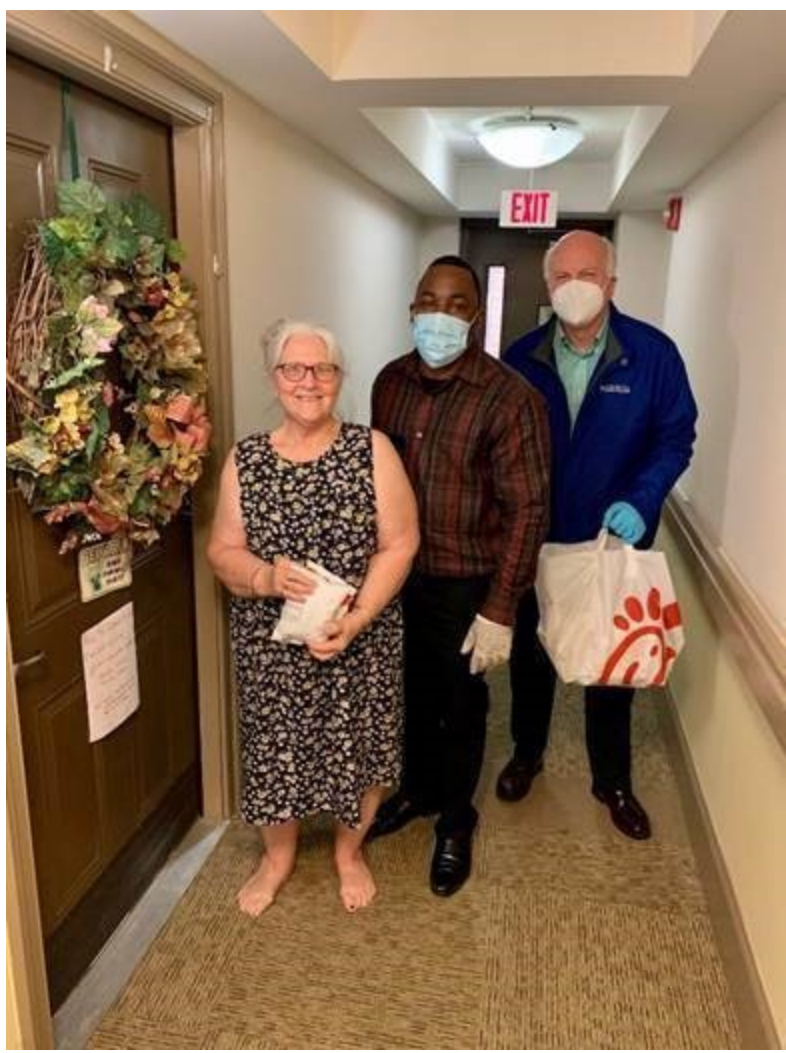
Posted by Christopher Bethel June 1, 2020