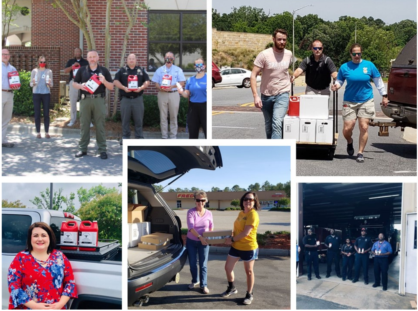
Posted by Anne Glenn June 1, 2020