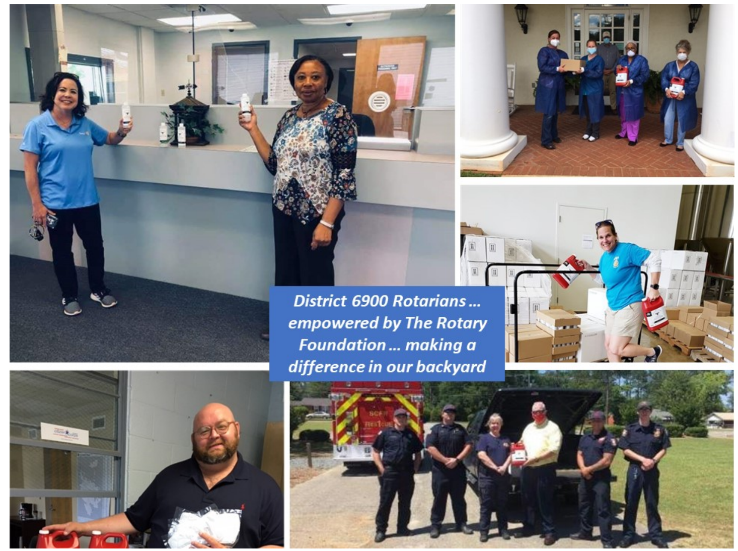
Posted by Anne Glenn June 1, 2020