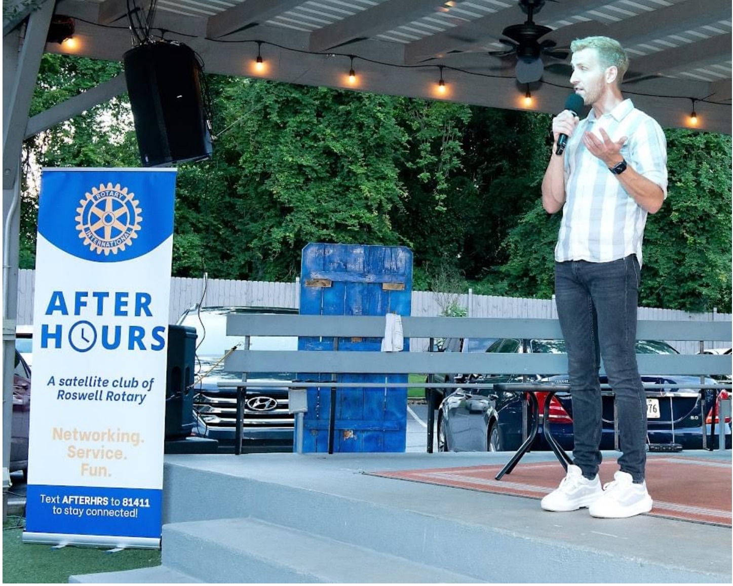
Posted by Becky Nelson July 5, 2023