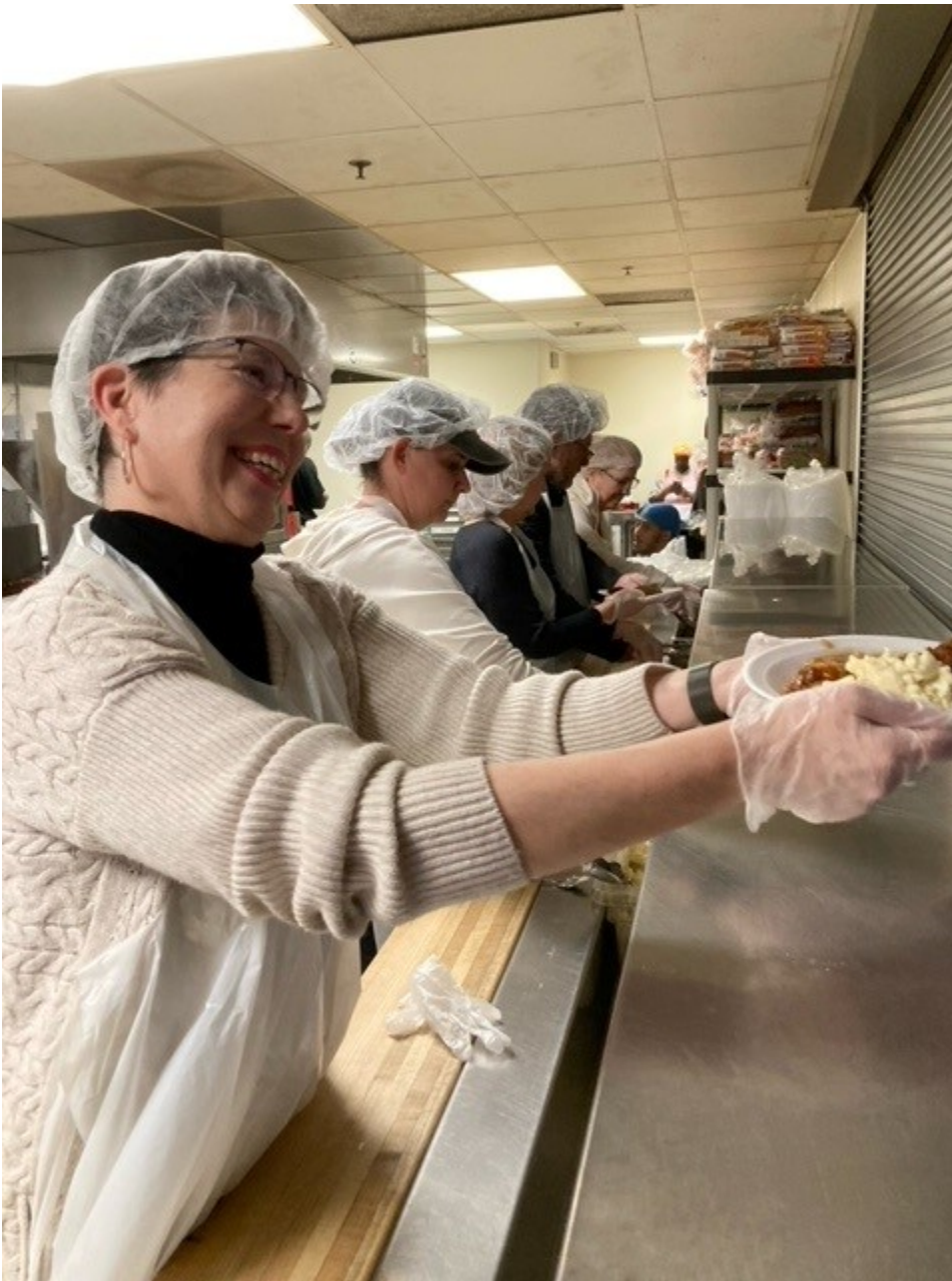
Posted by Brenda Borden March 5, 2024

others served a hot wing dinner and nachos with cheese during a Super Bowl party for the men at Atlanta Mission tonight. The club sponsored the party with a gift to the shelter which serves homeless men in downtown Atlanta.