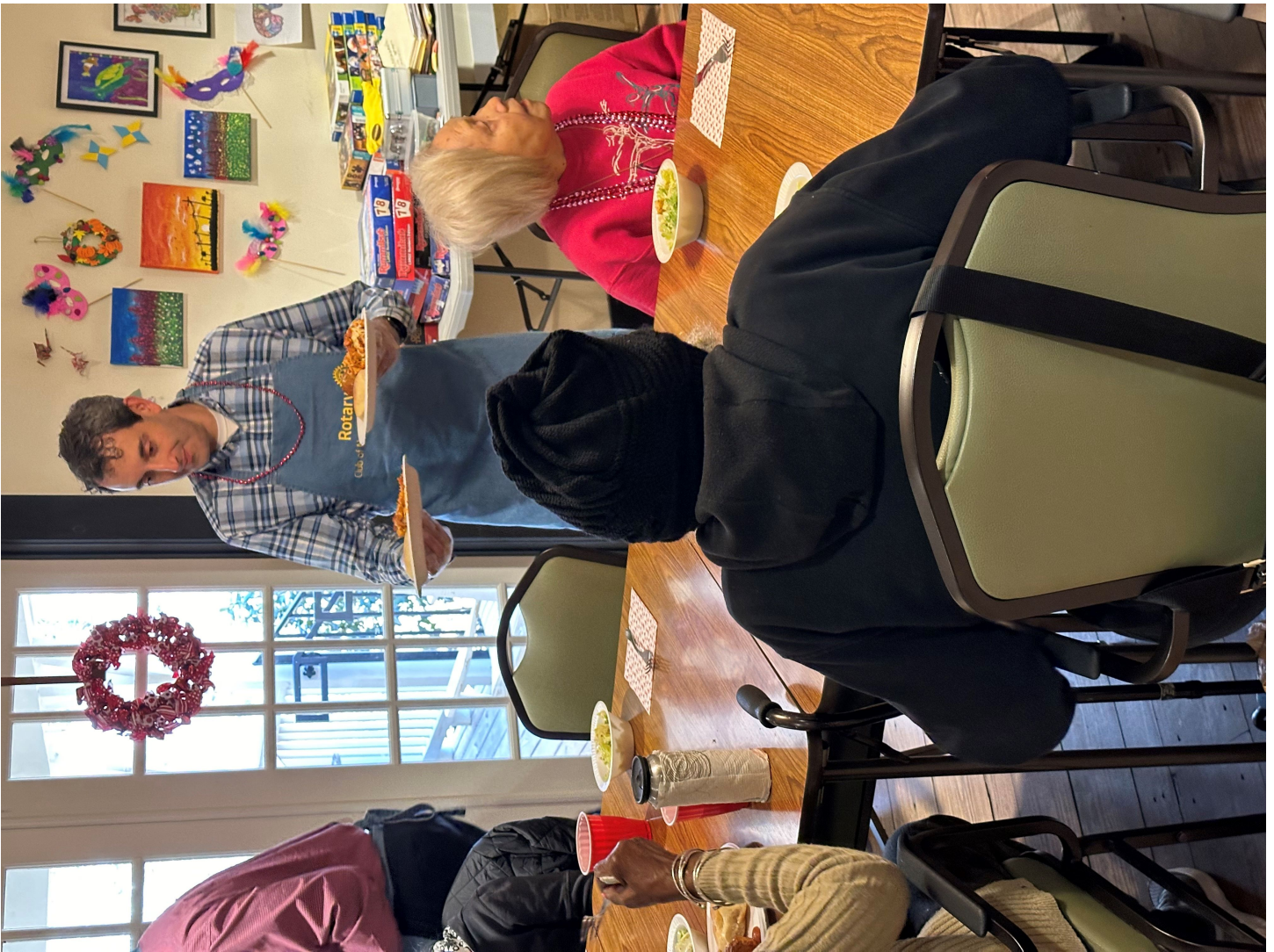
Posted by Lisa Gelber March 5, 2024