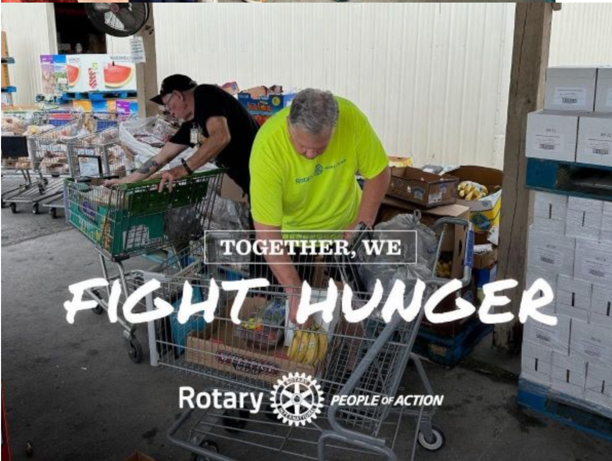
Posted by Amy Lemelin June 3, 2024